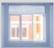
Window Opening UGX 280,000